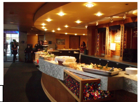
MCT Lobby—Great Food!